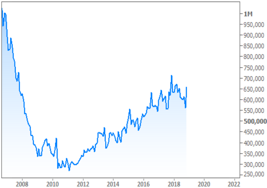
New Home Sales

In the same report, median prices of new homes had a completely different experience. They fell sharply.