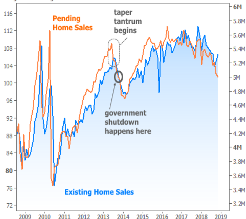
Pending and existing home sales

In the current case, things are a bit different. This time around the government shutdown hit during a fairly decent recovery in interest rates. It will give us a much better chance to see which one matters more. The only catch is that housing sales numbers for the time frame of the shutdown won't be out until later this month, and the most meaningful numbers won't be out until February or March.