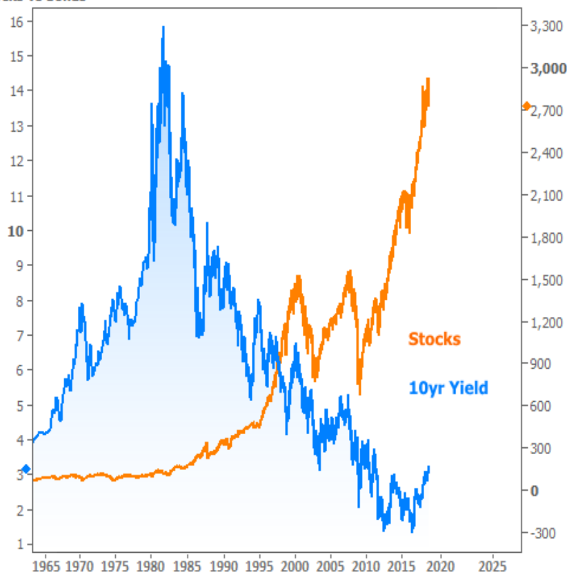
stocks vs bonds

Despite the chart above, stocks and rates actually DO spend quite a bit of time moving in the same direction. In fact, the only real misconception is that they're ALWAYS moving in the same direction. Sometimes, they're joined at the hip. Other times, they're clearly moving in opposite directions.