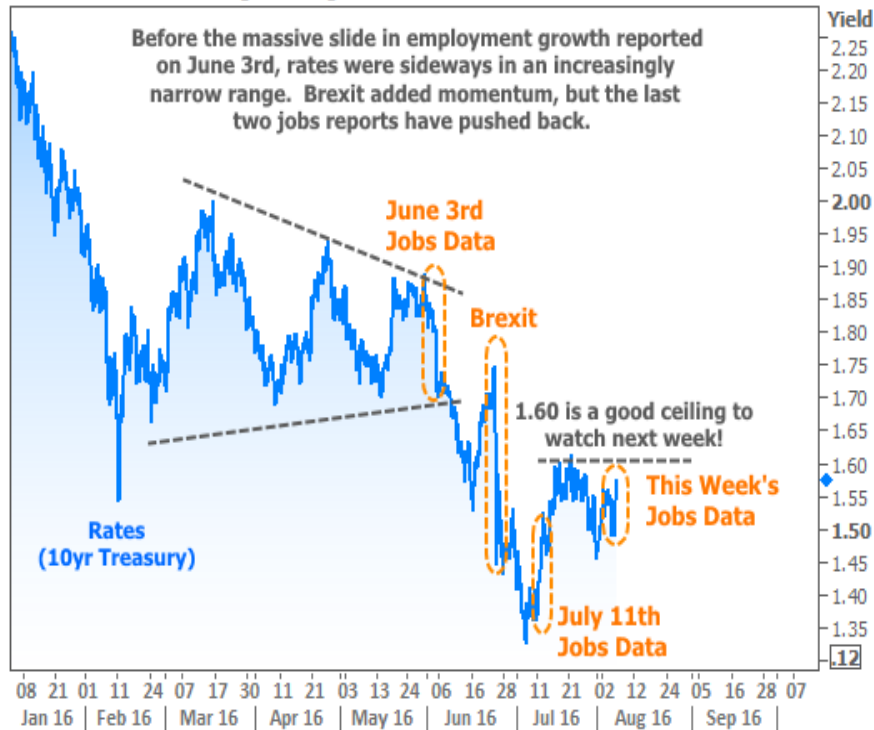
Rate Momentum Heading Into August

Now that we have a 2nd consecutive jobs report coming in so strong, the question is: will the upward momentum in rates be that much stronger? In considering that possibility, it will be useful to keep an eye on the low 1.6% range in 10yr Treasury yields, as that has been an important ceiling recently. When rates continually bounce against such ceilings, it's the market's way of letting us know it would be important if the ceiling ends up being broken.