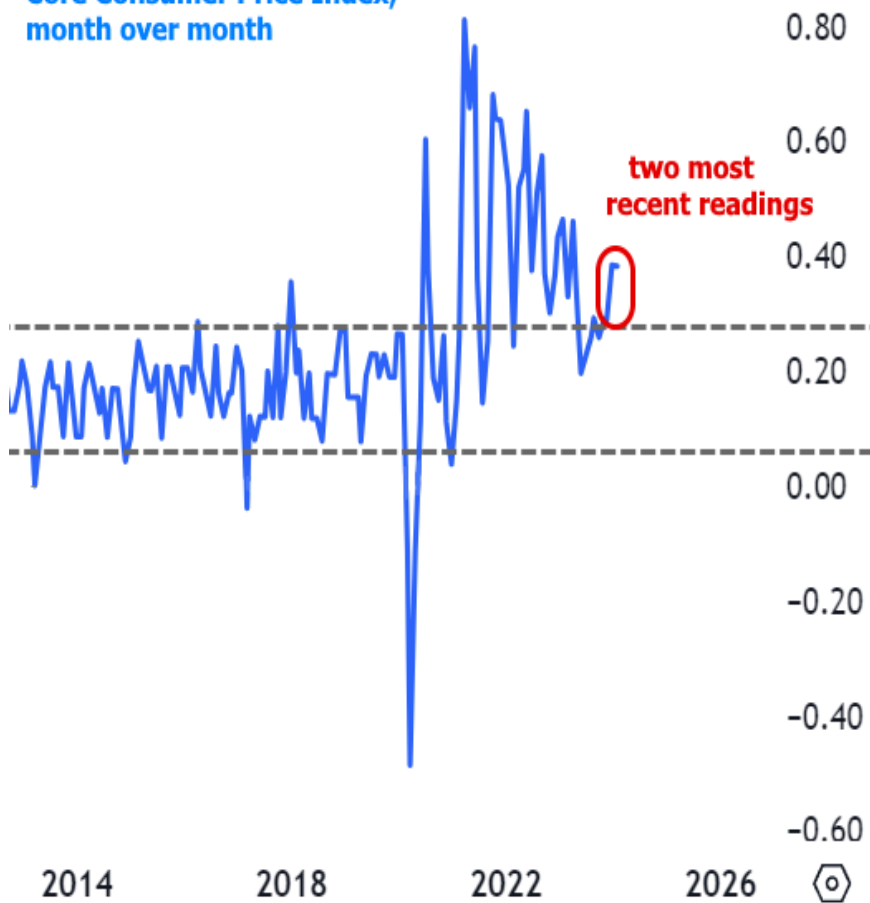
Core Consumer Price Index, month over month

The news wasn't quite as bad from the week's other key inflation report, but it certainly didn't help. The Producer Price Index (PPI), which measures wholesale inflation, has also now seen the highest two consecutive months since inflation first began to calm down in 2022.