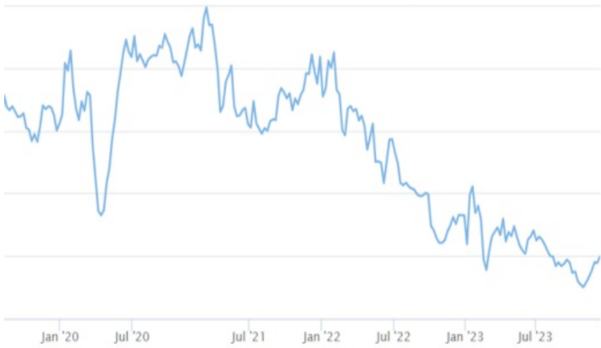
MBA Purchase Index

To get an idea of how much room we have for improvement, we can examine the exact same two metrics in a broader context.