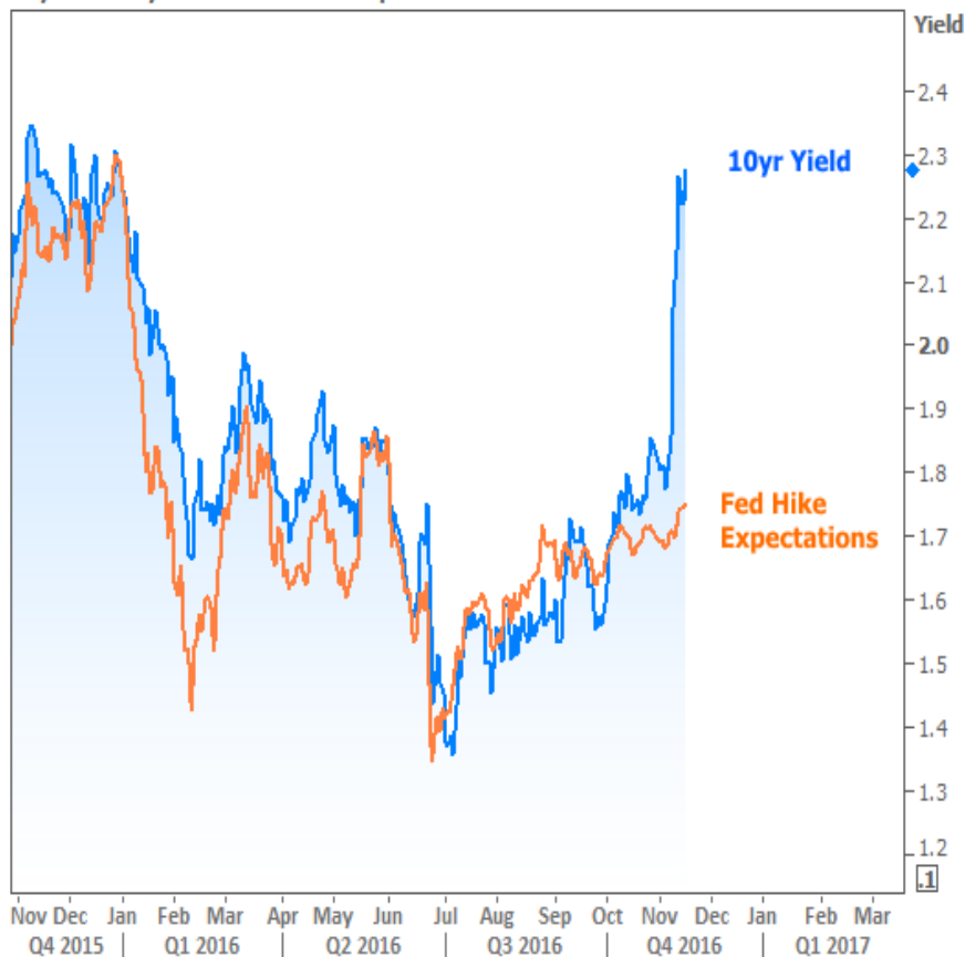
10yr Treasury Yield vs Rate Hike Expectations

If not Fed fears, then what other insidious enemy has bond markets so scared? There are actually several . These include any number of the following (in order of importance and apparent level of certainty):