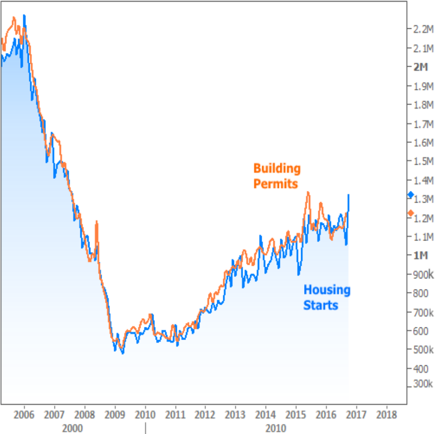
Housing Starts and Building Permits

Subscribe to my newsletter online at: http://mortgageratesupdate.com/mattstoutmortgagenavigator