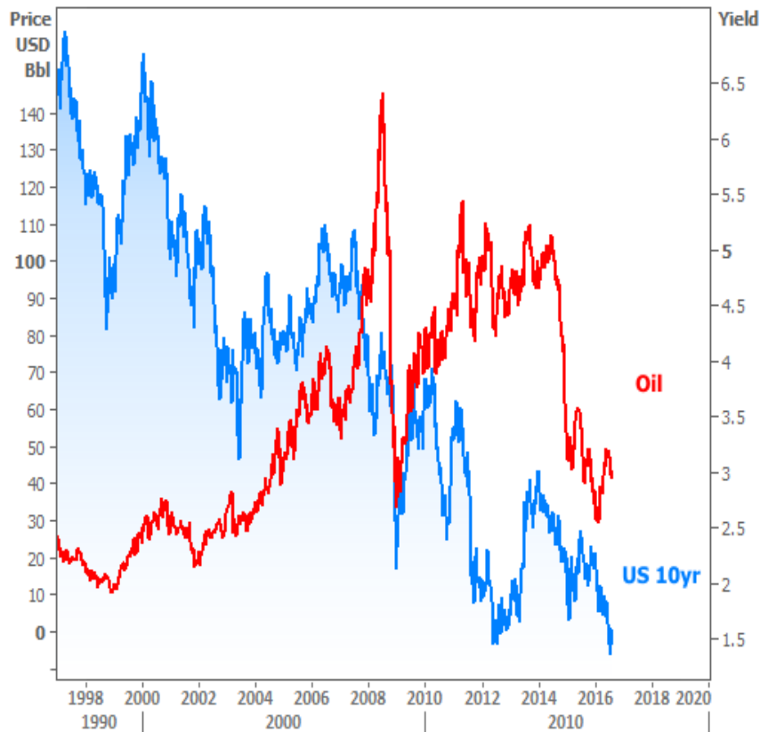
Oil vs Bonds

If it looks like rates and stocks have moved in exactly the opposite direction since 2009, it's because they have! The correlation with oil is slightly more defensible, but still far from relevant in the short term. It's currently receiving extra attention due to the massive drop in 2014, persistent weakness since then, and fear that prices will continue to fall.