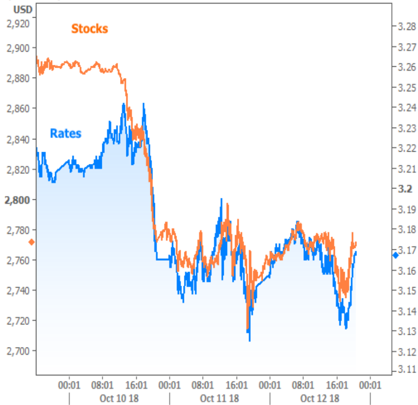
10yr Treasury Yield vs Stocks

The net effect was that mortgage rates fell back to their lowest levels since last Thursday by the end of the week. You may have seen news stories over the past two days talking about a "sharp move higher" in rates. This has to do with stale underlying data used by many media outlets to write their once-a-week mortgage rate article. The sharp move higher occurred LAST week, as we discussed at the time .