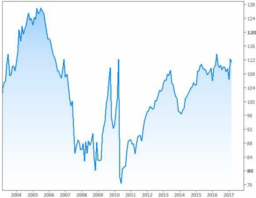
Pending Home Sales

The downturn was not unexpected . Pending home sales have moved up and down regularly in recent months, pretty accurately predicting, as they are designed to do, the see-saw behavior of existing home sales. Econoday's poll of analysts came up with a consensus of a -0.5 percent decline after February's 5.5 percent increase. Predictions ranged from -1.2 percent to