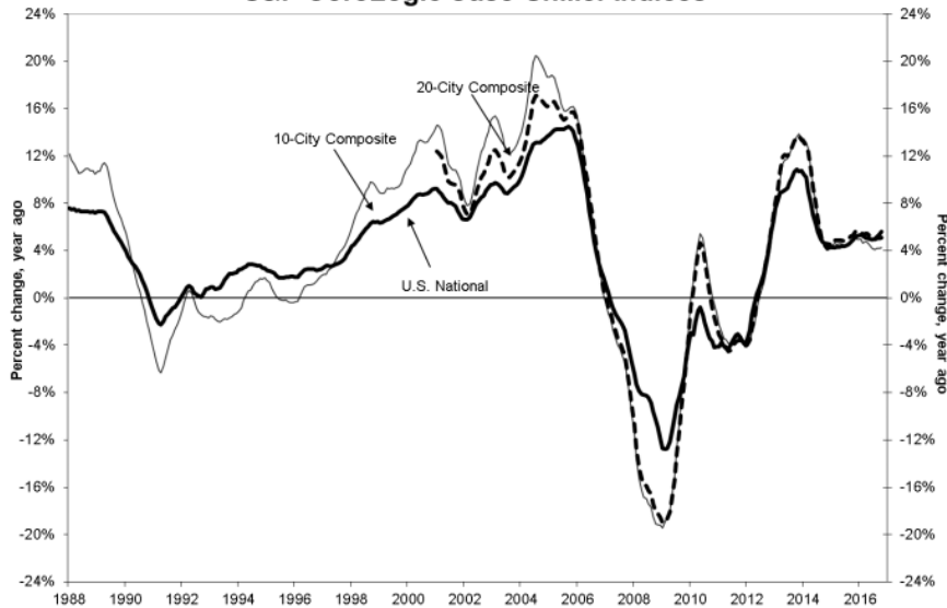
S&P CoreLogic Case-Shiller Indices

Sources: S&P Dow Jones Indices & CoreLogic