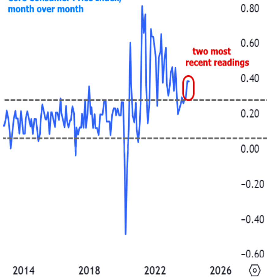
Core Consumer Price Index, month over month

The news wasn't quite as bad from the week's other key inflation report, but it certainly didn't help. The Producer Price Index (PPI), which measures wholesale inflation, has also now seen the highest two consecutive months since inflation first began to calm down in 2022.