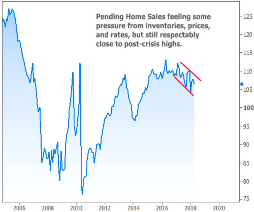
Pending Home Sales