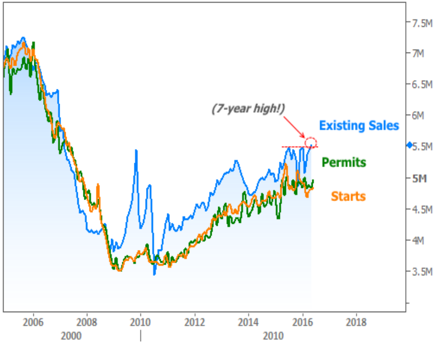
Existing Home Sales, Housing Starts, Building Permits

How concerned should we be about this lack of progress in construction activity?