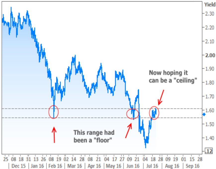
US 10yr Yield

If the battle with this ceiling isn't resolved before then, next week's events will probably help speed the process along. The headliners include announcements from the Fed and the Bank of Japan. The Fed is not expected to hike rates at this meeting, but they could drop hints, given ebbing panic surrounding the UK's vote to exit the EU, as well as the stronger jobs numbers earlier this month.