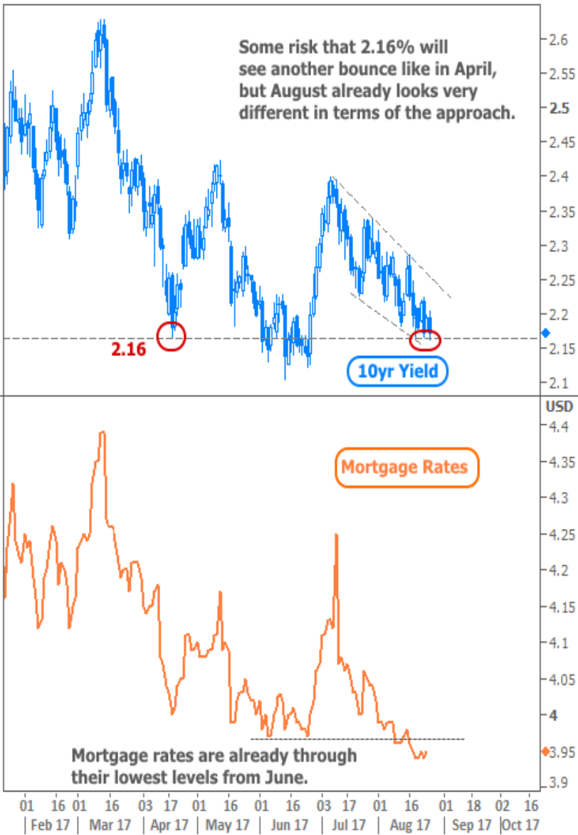
10yr Treasury Yield vs Mortgage Rates

Unfortunately, both New and Existing Home Sales also fell to the lowest levels of the year in reports issued by the Census Bureau and the National Association of Realtors respectively. This data wasn't of great interest to financial markets but it could get more interesting for the housing market. If year-over-year sales continue to operate near or below 0% in the coming months, it could signal the contraction that some economists were worried about last year. For now though, the drop in sales is isolated.