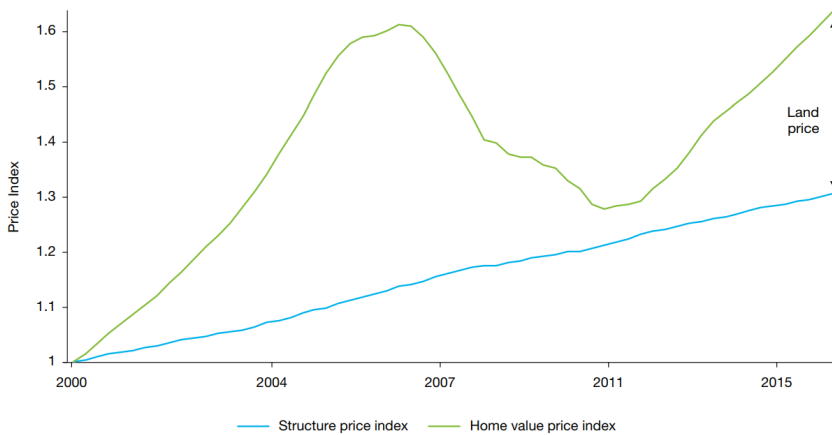
Share of land price in home value