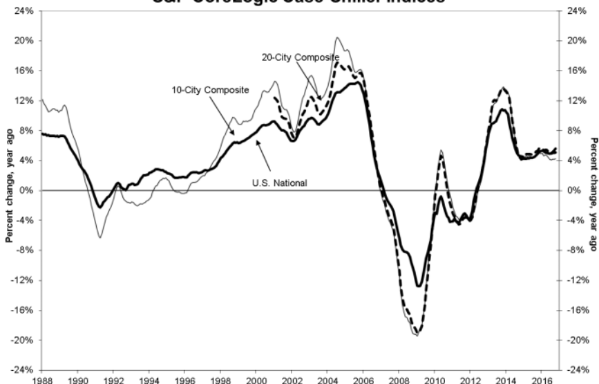
S&P CoreLogic Case-Shiller Indices

Sources: S&P Dow Jones Indices & CoreLogic