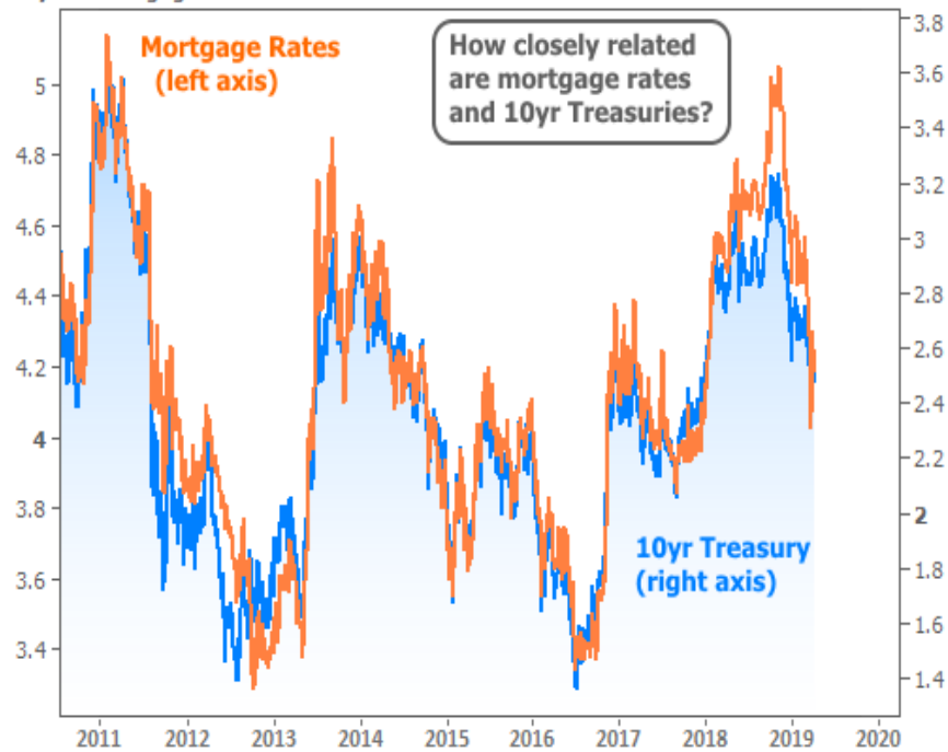
10yr vs Mortgage Rates

Clearly, 10yr Treasury yield movement is exceedingly relevant to mortgage rates. Treasuries are much more liquid, much more actively traded, and do a much better job of capturing the market's every little hope and concern. Simply put, they're what you want to follow if you want the maximum amount of information about longer-term rates.