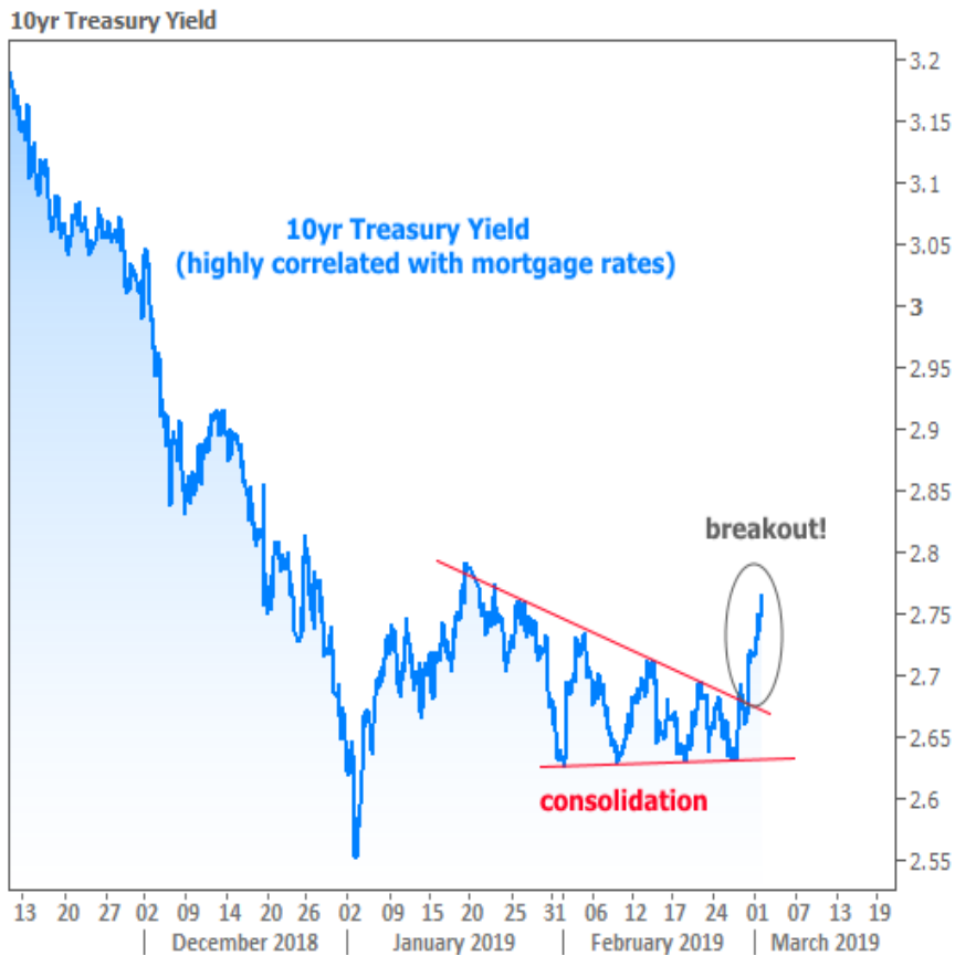
10yr Treasury Yield (highly correlated with mortgage rates)