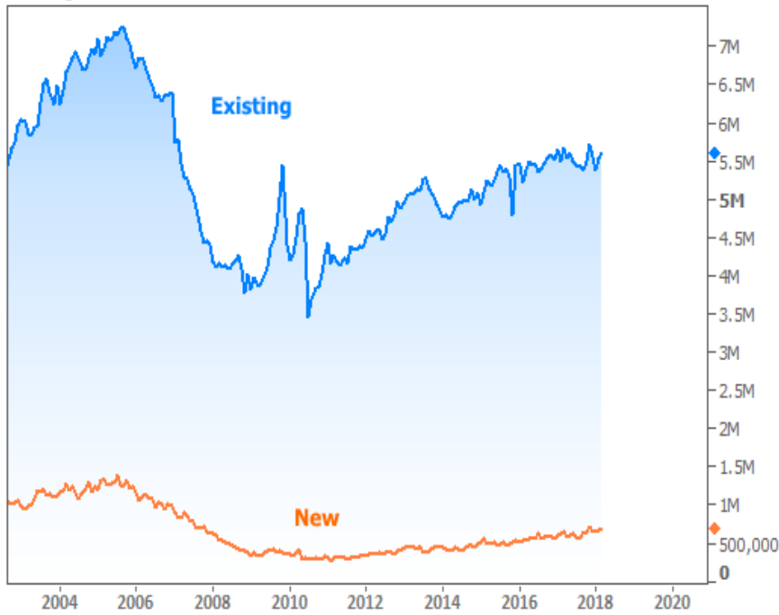
Existing vs New Home Sales

Next week brings the big jobs report (Employment Situation/Nonfarm Payrolls), which always has the potential to cause volatility for rates. Before that, we'll get a Fed policy announcement on Wednesday. The Fed can also cause huge moves for rates, but it's somewhat less likely next week. The Fed has 2 types of meetings: those that result in an announcement AND updated forecasts (as well as a press conference with the Fed Chair) and those that simply end with the announcement. Next week's is the latter, and that iteration tends not to pack the same sort of punch.