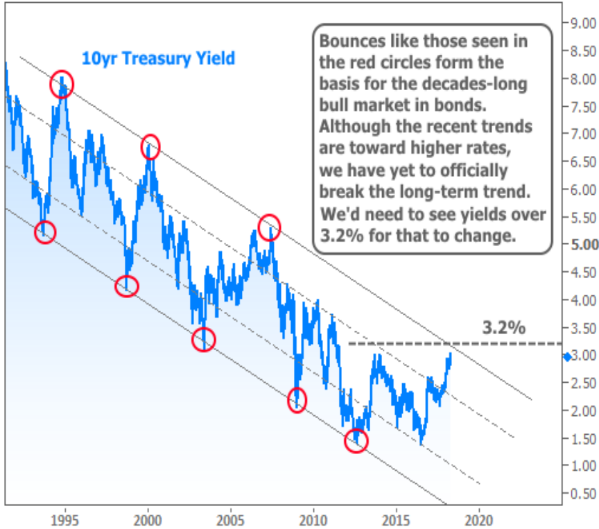
10yr Treasury Yield

That said, it's good to remember that the next trend could already have taken shape inside the current trend. Some analysts are pointing to the "higher lows" in rates in 2017 and (likely) 2018. They could be right, but history has sobering reminders about predicting future market movement. Specifically, there are a ton of "higher lows" in the past that ended up going nowhere.