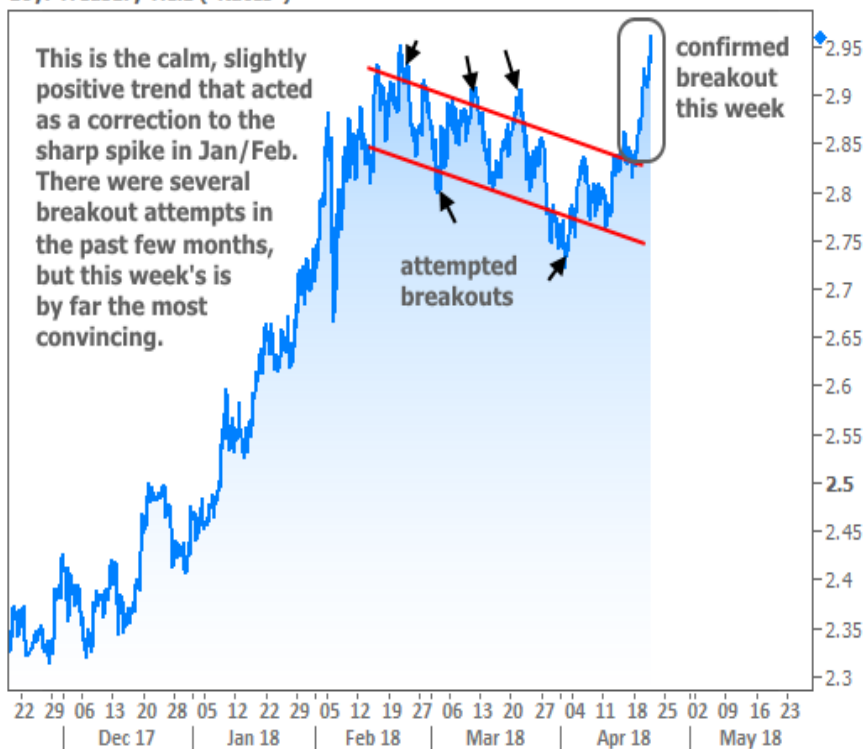
10yr Treasury Yield ("Rates")

This old wolf not only gets a bad rap, but he also gets more credit than he deserves . Rate spikes like this are simultaneously feared as a negative indicator for housing and blamed for spooking the stock market. A housing hit seems logical enough. After all, rates affect affordability. But in reality, none of the ups and downs in rates over the past few years have had commensurate impacts on housing numbers.