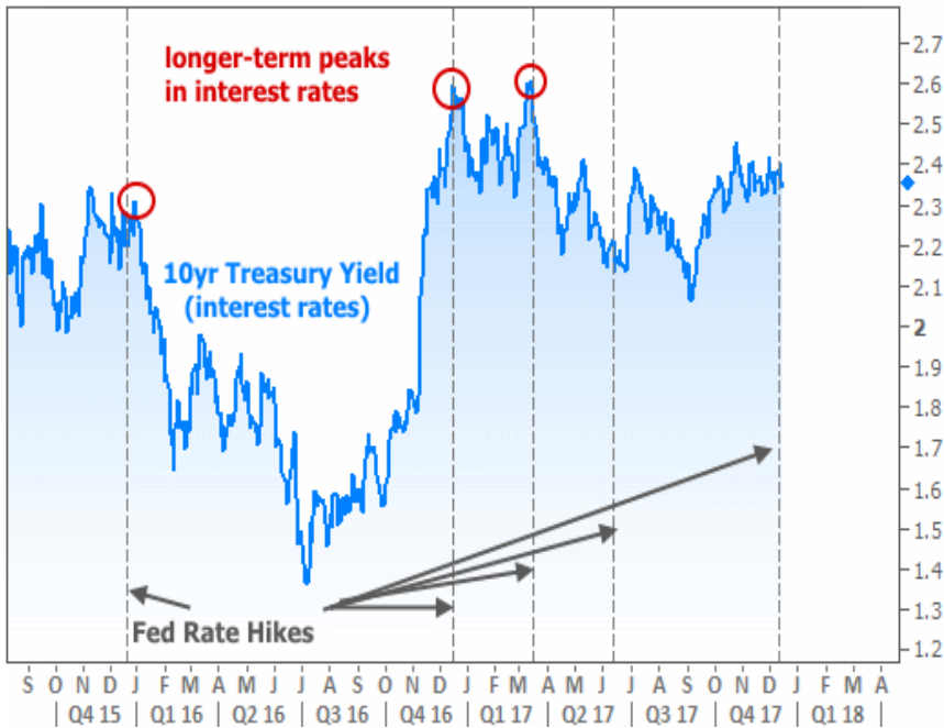
Rates and Rate Hikes

Other parts of this week's Fed communications were still important , but they actually helped rates move LOWER. Chief among these were the Fed's economic projections .