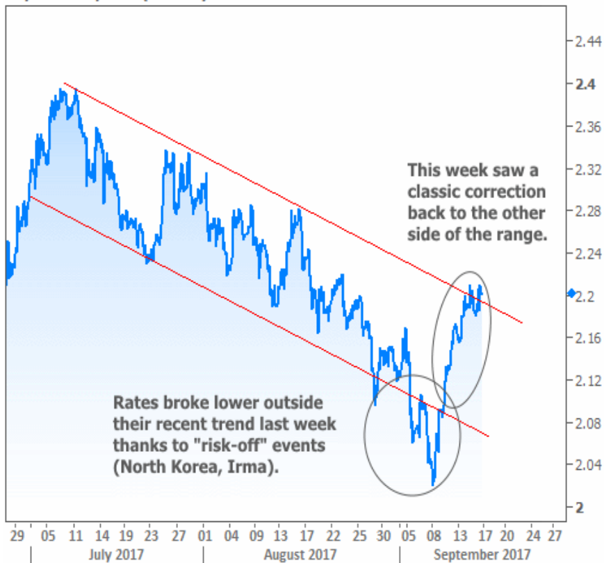
10yr Treasury Yield ("Rates")

The bulk of the correction took place during the first 3 days of the week. Rates found a supportive ceiling around 2.22% in terms of 10yr yields, but weren't interested in moving much lower for a few reasons. The most obvious reason would be that last week's gains were based on temporary factors.