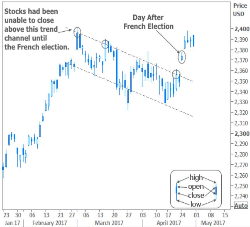
S&P 500 (daily candlesticks)

We might take the stock breakout with a grain of salt for a few reasons. First of all, it's earnings season, which often provides some extra levity. From a technical perspective, the S&P (the index of choice among traders) was unable to break above March 1st's all-time highs. If that ceiling remains intact, stock traders will increasingly think about checking out the lower side of the range. To whatever extent that happens, bond markets would reap some of the benefits of the money flowing out of stocks (more bond buying = lower rates).