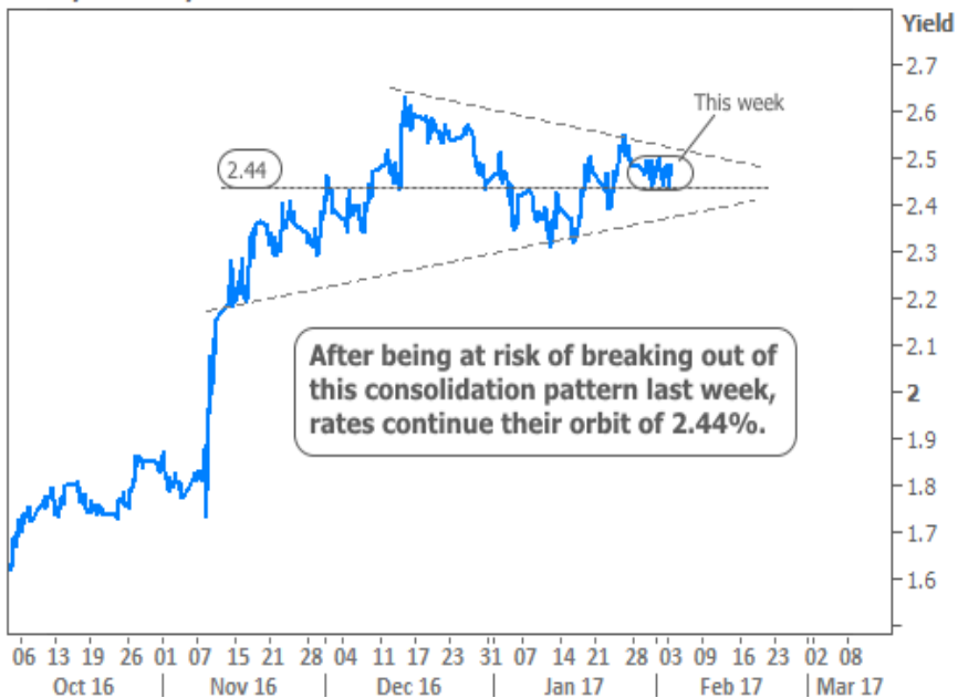
US 10yr Treasury Yield

In addition to the Fed, there were several important economic reports this week. Chief among those was Friday's nonfarm payrolls data (the big "jobs report"). Although payroll growth outpaced expectations, wage growth not only fell short, but was also revised lower for the previous month. Wage metrics are closely-watched by both markets and the Fed right now, with the expectation being that rising wages will stoke inflation and thus, faster rate hikes. The weak wage data helped rates hold their ground.