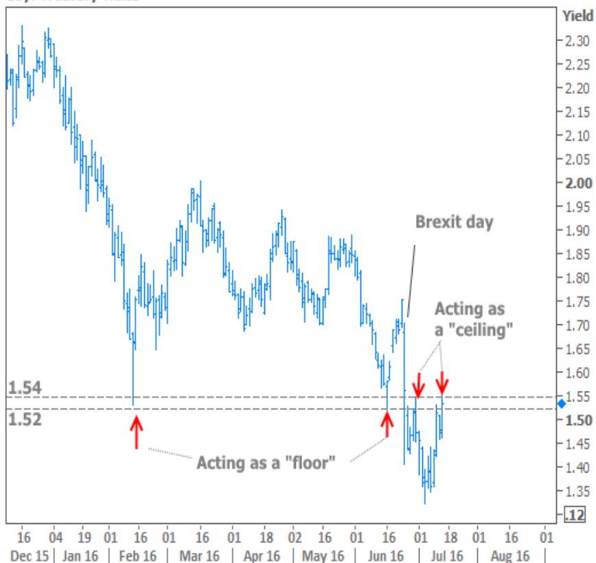
10yr Treasury Yields

Of course, when it comes to financial markets, repetitions of past patterns won't always predict the future. However, repetition does build a case for a certain level being significant. It's as simple as this: if rates hardly ever break through a given level, it's easier to argue that it means something when they do.