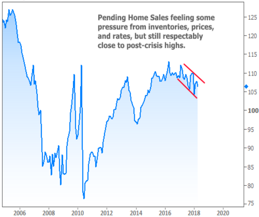
Pending Home Sales

Subscribe to my newsletter online at: http://mortgageratesupdate.com/statz