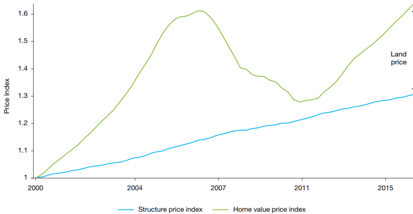
Share of land price in home value