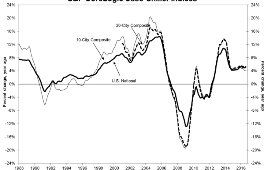
S&P CoreLogic Case-Shiller Indices

Sources: S&P Dow Jones Indices & CoreLogic