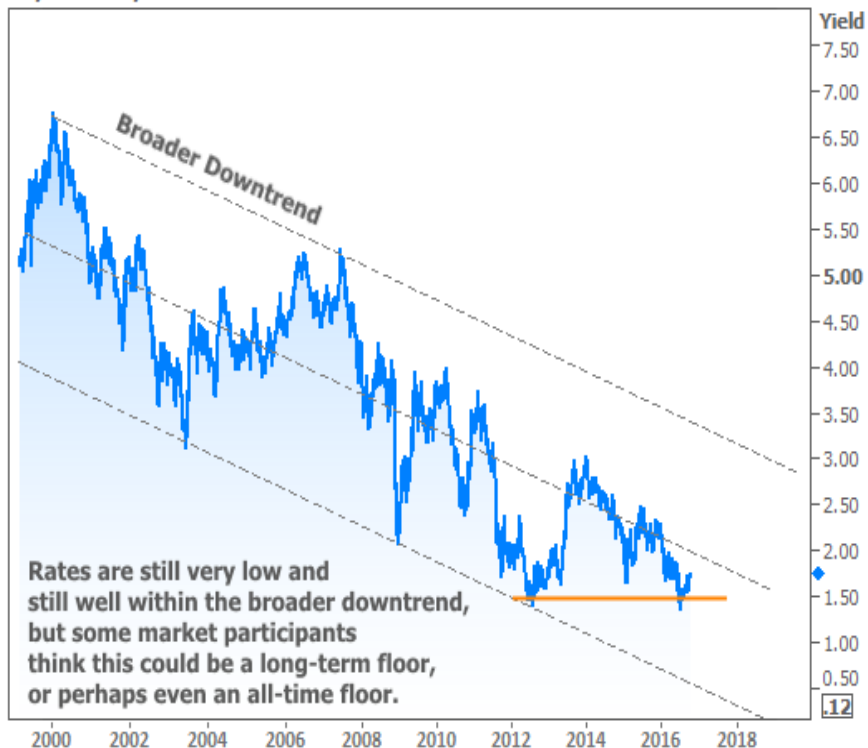
10yr Treasury Yields

Subscribe to my newsletter online at: http://mortgageratesupdate.com/statz