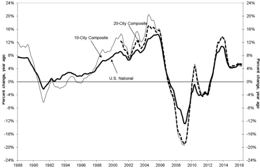
S&P/Case-Shiller Home Price Indices

Source: S&P Dow Jones Indices & CoreLogic