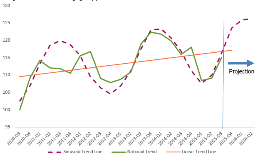
Figure 1: National Mortgage Application Fraud Index

Looking toward 2016 however Fortenberry says that it is likely the loosening credit guidelines and a recovery of the purchase mortgage market will again return some of the opportunities and motivation for fraud. One possibility is that inflated home prices will be used to cover misrepresentation of down payments.