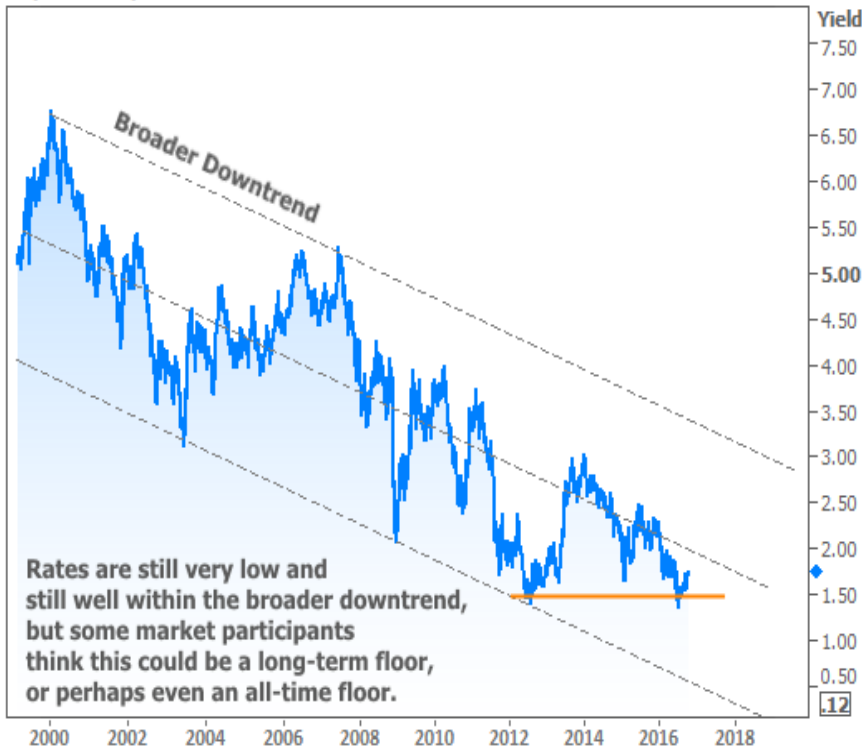
10yr Treasury Yields

Subscribe to my newsletter online at: http://mortgageratesupdate.com/statz