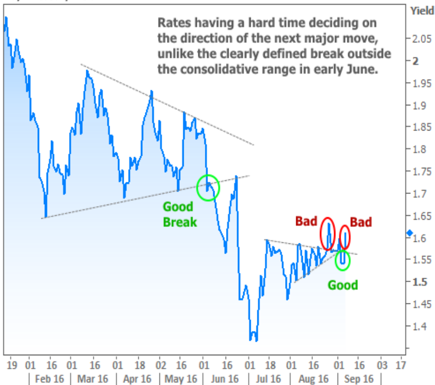
10yr Treasury Yield

Conventional market wisdom holds that rates tend to make bigger moves when they break out of these patterns. Early June was a classic example (as seen in the following chart). But the more recent example is having a hard time making up its mind.