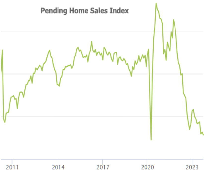
Pending Home Sales Index

It's a similar story for interest rates. 2022 was marked by the largest change in mortgage rates in a single year since 1981, but 2023 took the outright levels just a bit higher.