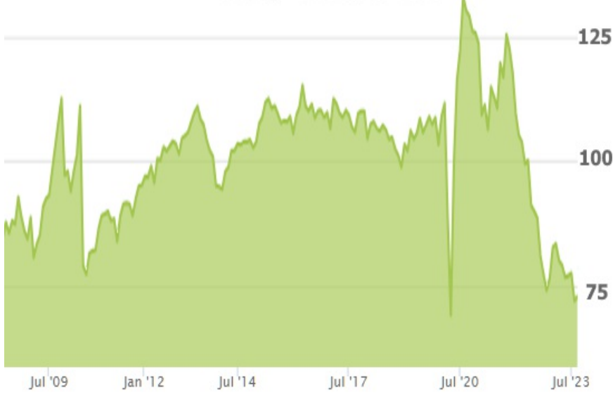
Pending Home Sales Index

Both charts convey post-covid volatility, but one says the housing market is stable and improving while the other says it's as bad as it's been in decades. How can two reports on home sales tell such different stories?