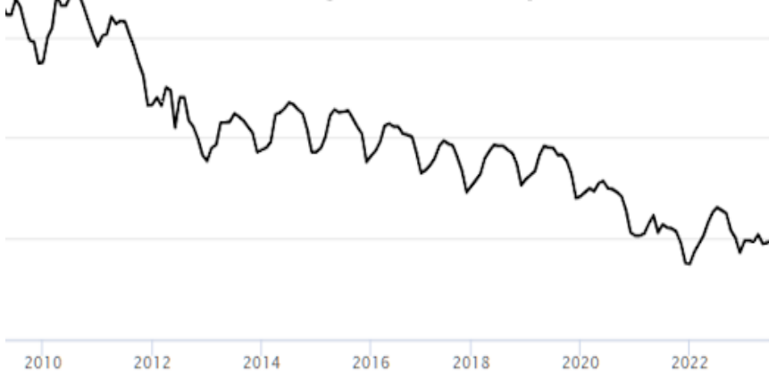
Existing Home Inventory

Here's New Home Inventory over the same time frame: