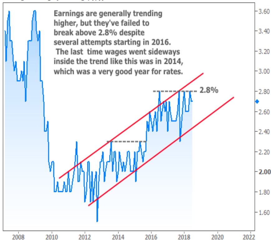
Average Earnings (% Change, y/y)

OK, maybe we should move on. You said something about home sales and glimmers of hope?