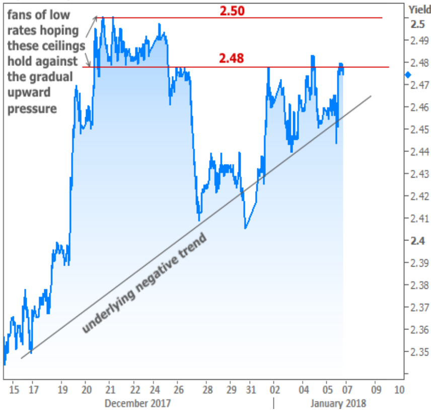
10yr Treasury Yield

Subscribe to my newsletter online at: http://mortgageratesupdate.com/bennettcapitalpartnersmortgage