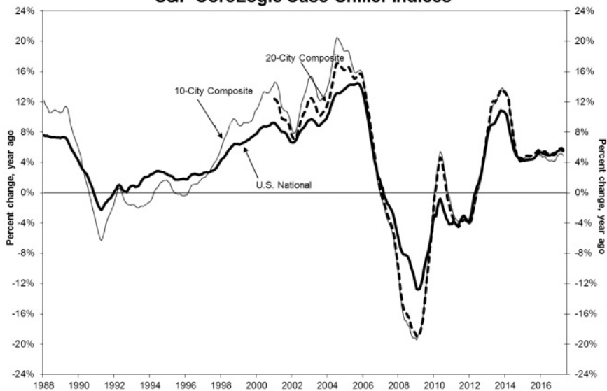
S&P CoreLogic Case-Shiller Indices

Sources: S&P Dow Jones Indices & CoreLogic