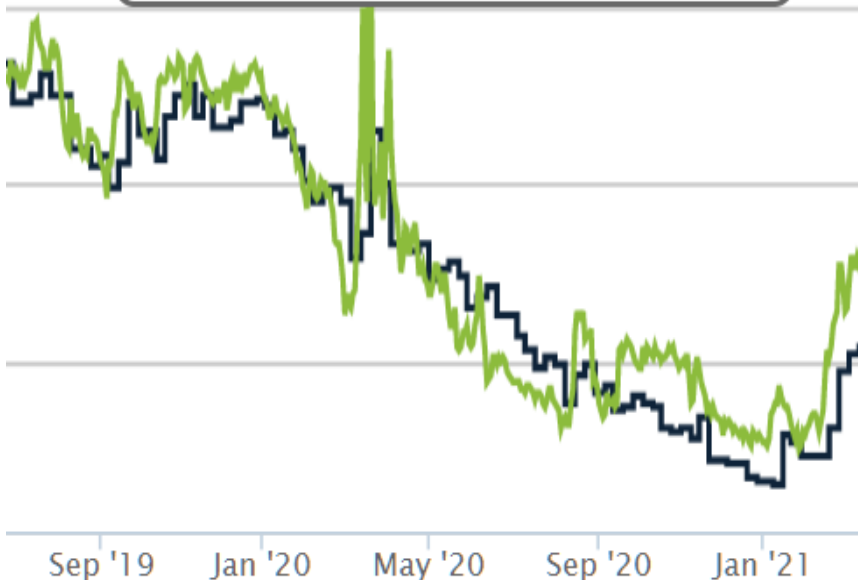
30yr Fixed Mortgage Rates — Freddie Mac Weekly Survey Rates (purchase) — Actual Daily Average Rates (Including Refis)

It's March 2021, and you'd now have to go back to March 2020 to see higher mortgage rates. It will take mainstream media a while to get caught up with this new reality because the most widely cited mortgage rate survey tends to lag behind sharp moves like this.