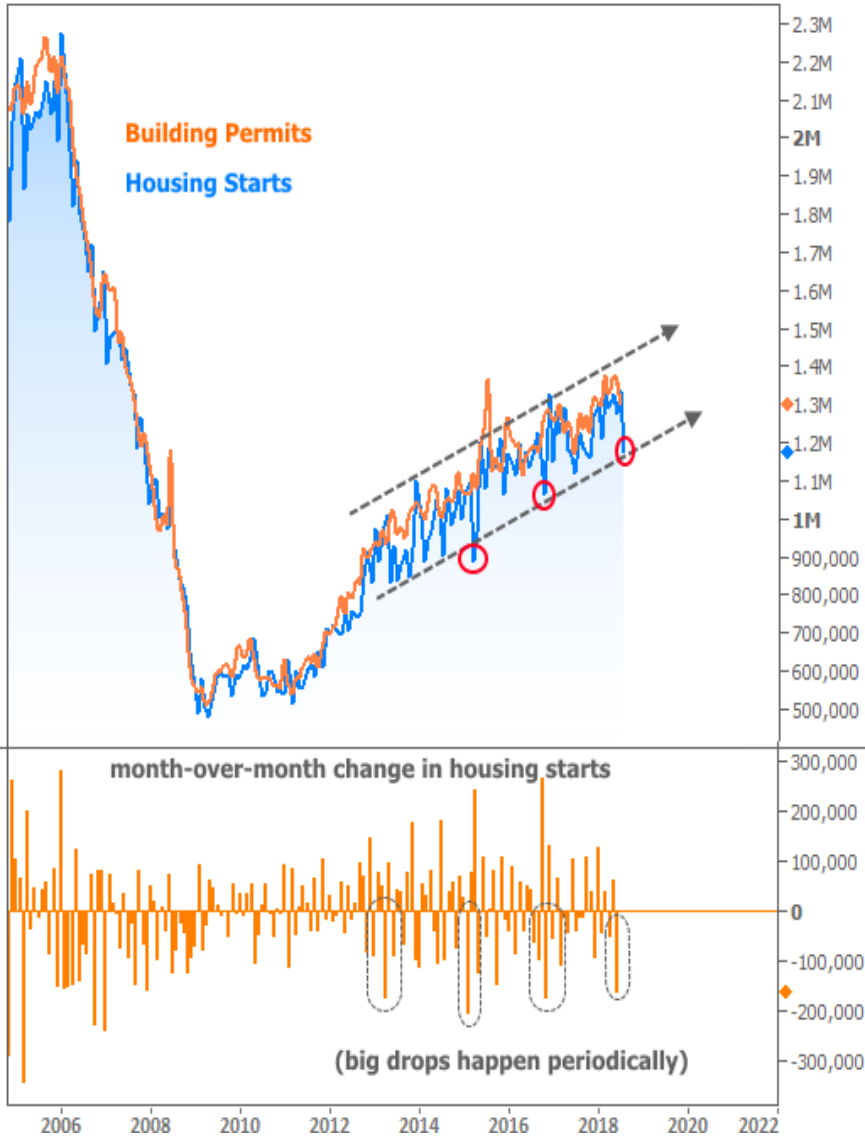
Starts vs Permits

Big drops in housing starts happen from time to time. And despite this particular drop, a positive trend remains intact.