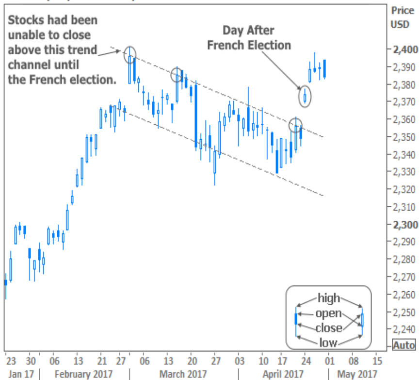
S&amp;P 500 (daily candlesticks)

We might take the stock breakout with a grain of salt for a few reasons. First of all, it's earnings season, which often provides some extra levity. From a technical perspective, the S&P (the index of choice among traders) was unable to break above March 1st's all-time highs. If that ceiling remains intact, stock traders will increasingly think about checking out the lower side of the range. To whatever extent that happens, bond markets would reap some of the benefits of the money flowing out of stocks (more bond buying = lower rates).