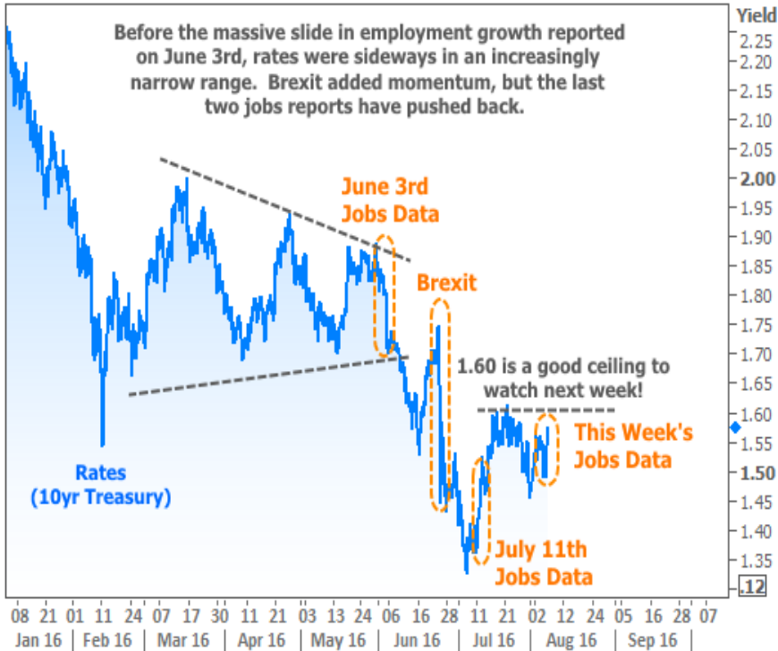
Rate Momentum Heading Into August

Now that we have a 2nd consecutive jobs report coming in so strong, the question is: will the upward momentum in rates be that much stronger? In considering that possibility, it will be useful to keep an eye on the low 1.6% range in 10yr Treasury yields, as that has been an important ceiling recently. When rates continually bounce against such ceilings, it's the market's way of letting us know it would be important if the ceiling ends up being broken.