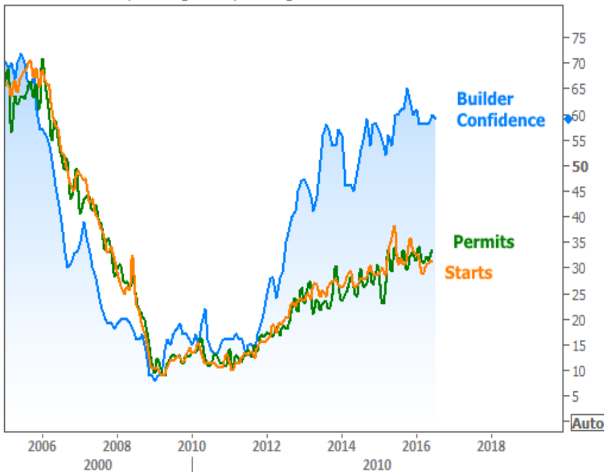
Builder Confidence, Housing Starts, Building Permits

The answer will likely vary depending on your individual outlook on the economy and the housing market. There are several forces at work here. One of the most frequently-cited is that it's simply in builders' best interest to build fewer, bigger houses for economic reasons. The other major consideration is the relative boom in multifamily construction. Both of these would help explain builders' ability to remain much more upbeat than residential construction numbers would suggest.