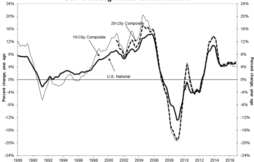
S&P CoreLogic Case-Shiller Indices

Sources: S&P Dow Jones Indices & CoreLogic