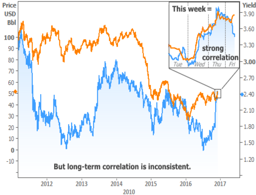
Rates vs Oil

Oil prices do indeed have strong correlations with interest rate movements. This week was a good example of that, as we'll see in the following chart. But the chart also shows that this week's correlation is a small drop in a much bigger bucket.