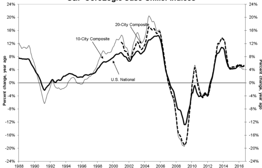
S&P CoreLogic Case-Shiller Indices

Sources: S&P Dow Jones Indices & CoreLogic