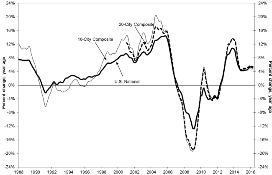
S&P/Case-Shiller Home Price Indices

Source: S&P Dow Jones Indices & CoreLogic