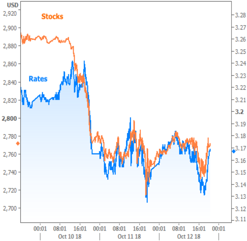
10yr Treasury Yield vs Stocks

The net effect was that mortgage rates fell back to their lowest levels since last Thursday by the end of the week. You may have seen news stories over the past two days talking about a "sharp move higher" in rates. This has to do with stale underlying data used by many media outlets to write their once-a-week mortgage rate article. The sharp move higher occurred LAST week , as we discussed at the time.