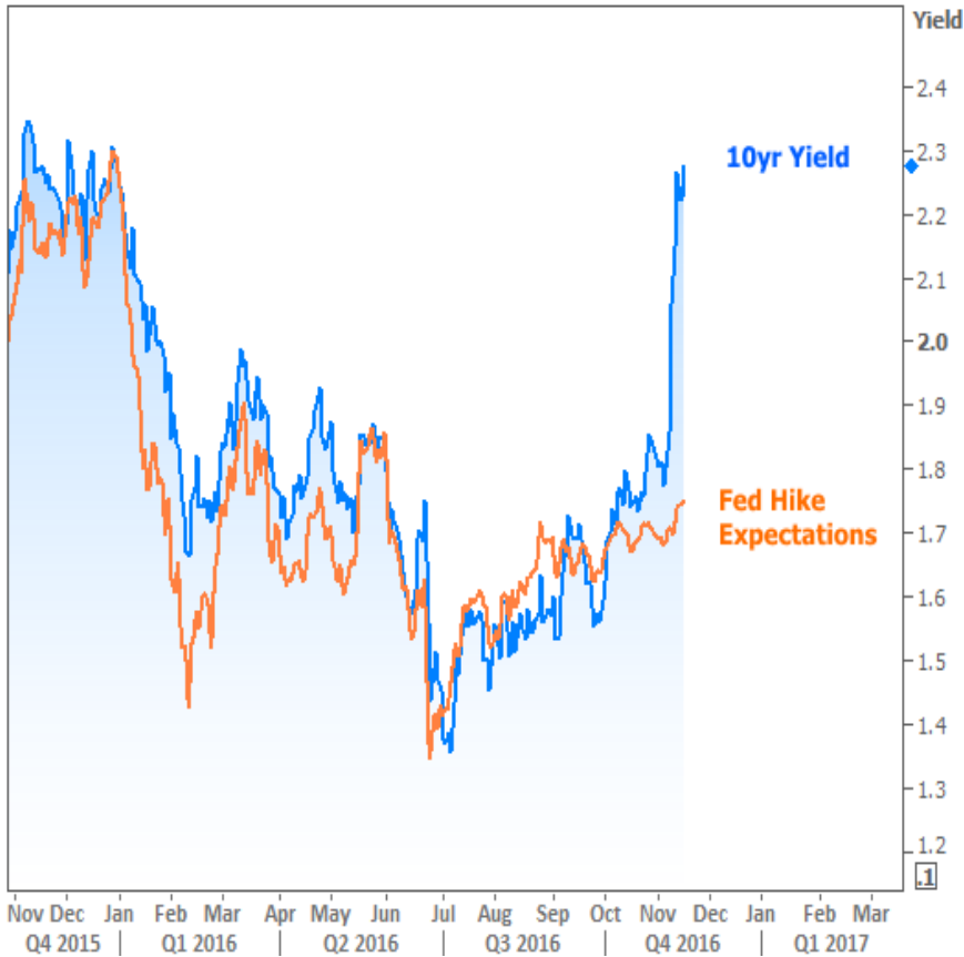
10yr Treasury Yield vs Rate Hike Expectations

If not Fed fears, then what other insidious enemy has bond markets so scared? There are actually several . These include any number of the following (in order of importance and apparent level of certainty):